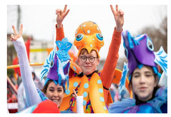
Limerick St Patrick's Festival celebrations will burst into life as the much anticipated St Patrick's Day parade makes a welcome return to the streets at 12pm on Thursday 17th March 2022!