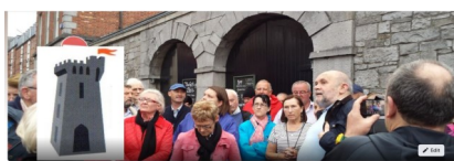
Limerick Historical Society (Ireland)

Our next evening walk will commence at St Michael's Church Wednesday 8th June at 7pm. After the tour of the interior of the Church we will travel down Barrington St to the old Jesuit church in the Crescent. All are very welcome to join us on the evening.