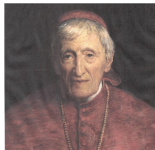
Canonisation of Cardinal John Henry Newman.