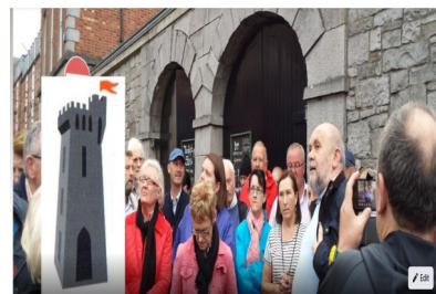
Limerick Historical Society (Ireland)

Remember the New venue: Christ Church Methodist Hall