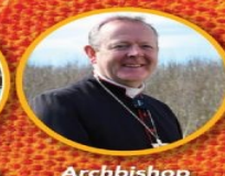
Archbishop Eamon Martin