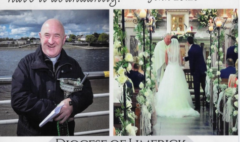
DIOCESE OF LIMERICK OCATIONS

vocations@limerickdiocese.org 061 350 000 Ext 209